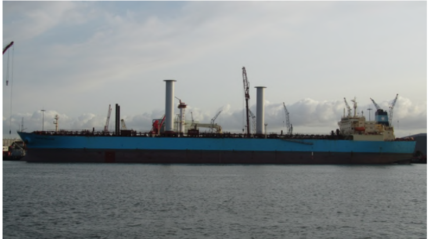
The Maersk Pelican with its rotor sails installed.

We are undeniably using up what little remains of Earth's petroleum, and because of that, it's getting expensive. To reduce fuel costs, shipping companies are turning back to sailboats. Yes, seriously. Sailboats. But they don't look like any sails you've seen before.